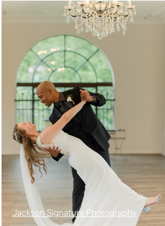
Jackson Signature Photography